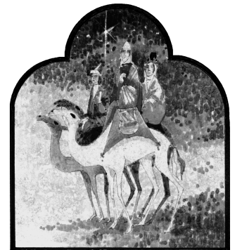
Magi from the east arrived

A few will be in on the secret: the colors of the beads are derived from the gifts of the magi. Gold for wealth, purple for power, green for good health. The gifts are also a key to the identity of the Christ Child: the incense for God; the gold for a king; the myrrh, fragrant burial ointment for one who comes to die.